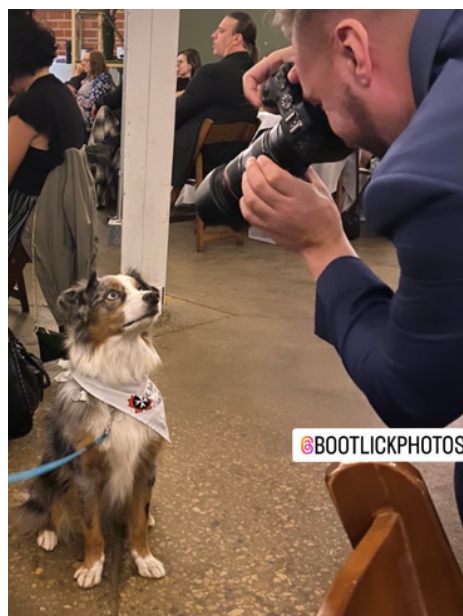
Guest Therapy Dog Dexter from St. John's Ambulance at the Safe Paws Gala